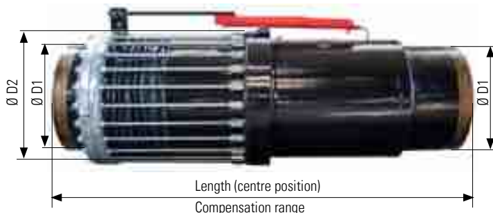
With pressure testing locking system (Compensator in centre position)