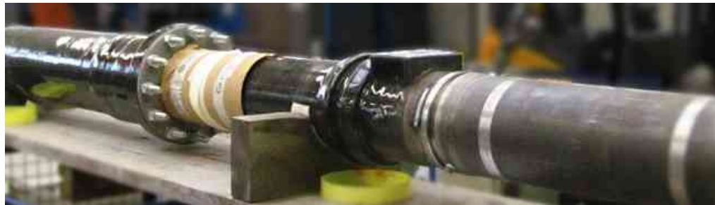
Fig. 2: Frictional force measurement on a DN200 / PN70 linear compensator

In addition to the actual pressure test on the components, Franz Schuck GmbH tests its linear expansion joints very extensively in specially designed test facilities and test stands. This includes, among other things, friction force measurements (see Fig. 2) and the determination of the bending angle, that occurs under the load with the bending moments from the pipeline.