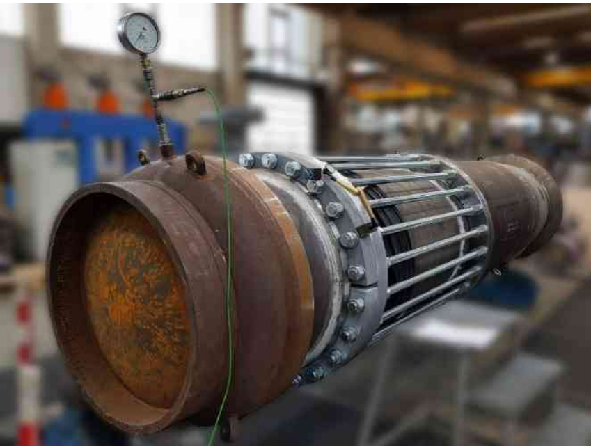
Fig. 1: Expansion joint DN1000 / PN84 during preparation for the hydrostatic strength test in the factory

Combined load cases are also simulated in the tests. For example, frictional forces can be determined while the compensator is being applied by the pipeline bending force.